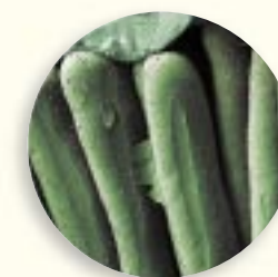
◀ This weed, sprayed with the imitator, has almost no droplets inside the leaf.