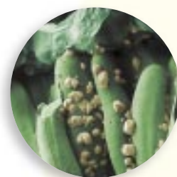
◀ This is a cross section of a weed leaf magnified 1000x. The yellow droplets mean Roundup PRO is already at work inside.